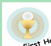
First Holy Communion