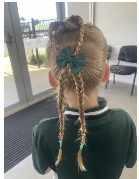
Example: Ribbon is suitable, but preferably not on PE days.