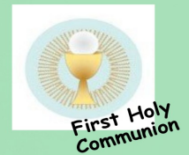
First Holy Communion