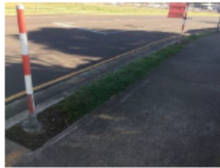
The sign below says it all – NO stopping

Failing to obey this can result in a $48 Traffic Infringement Notice for Stop contrary to continuous yellow edge line.